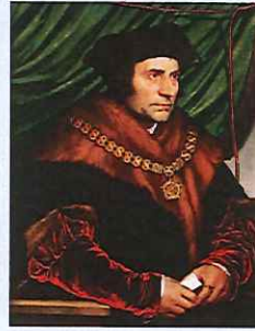
St. Thomas More, patron of lawyers

Phone: 973-377-1004 insidethewalls.org E-mail: SPIWinfo@patersondiocese.org